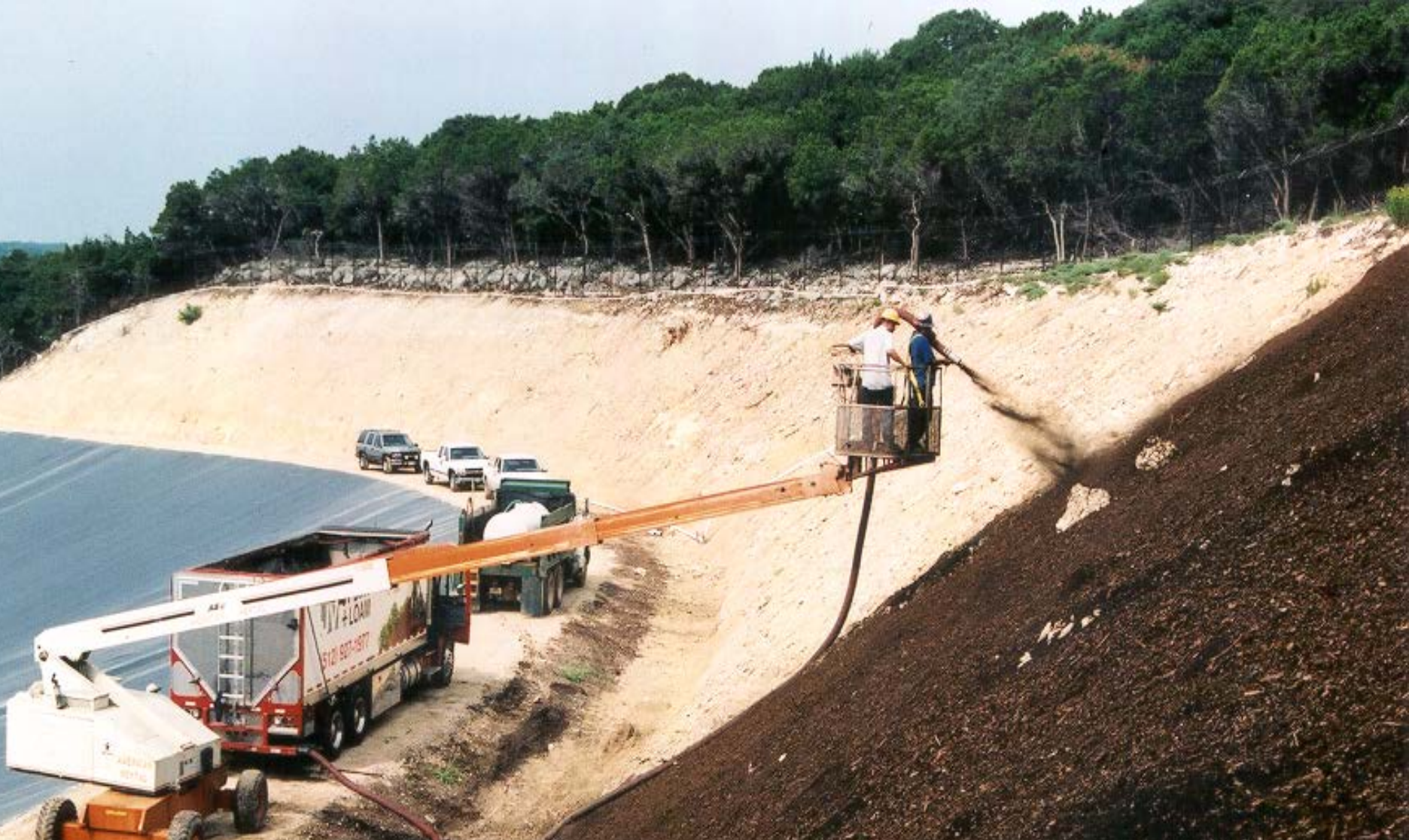
Application to 1:1 ROCK SLOPE 2" compost mulch w/native seed mix Barton Creek Development – Austin, TX AUGUST 17, 2002