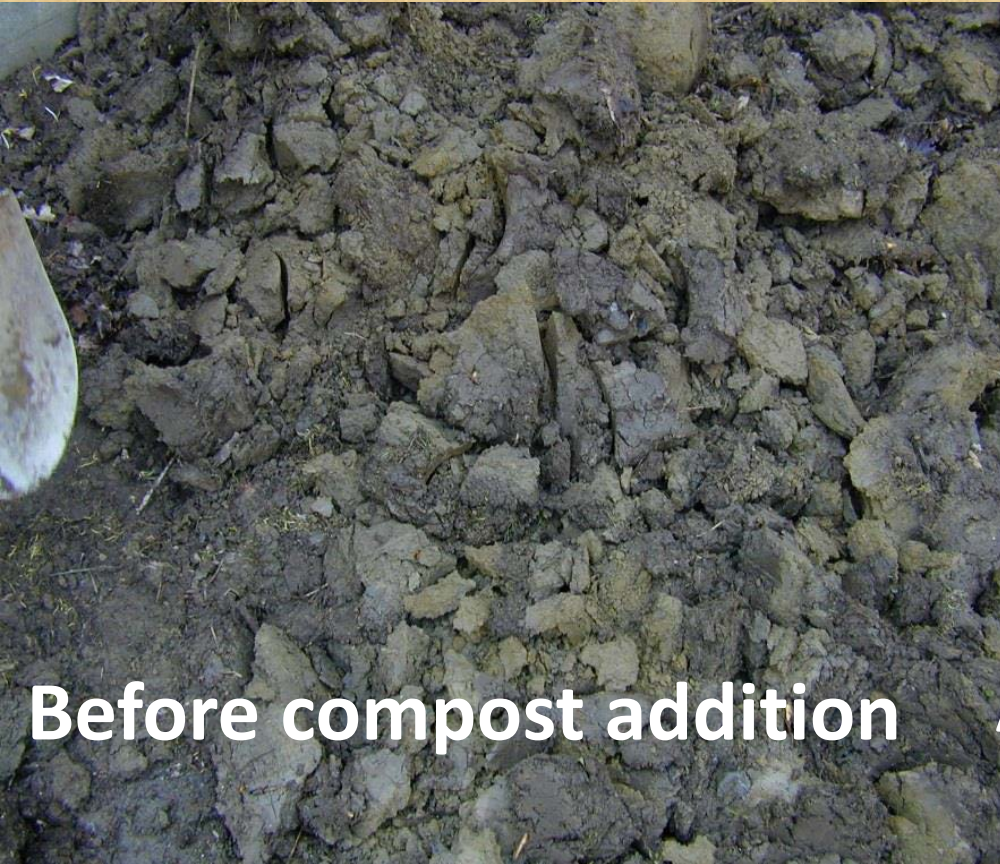
Before compost addition