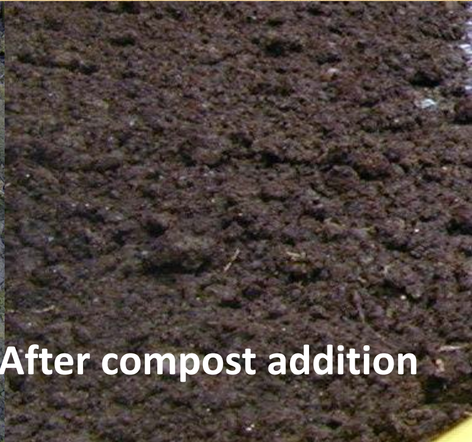
After compost addition