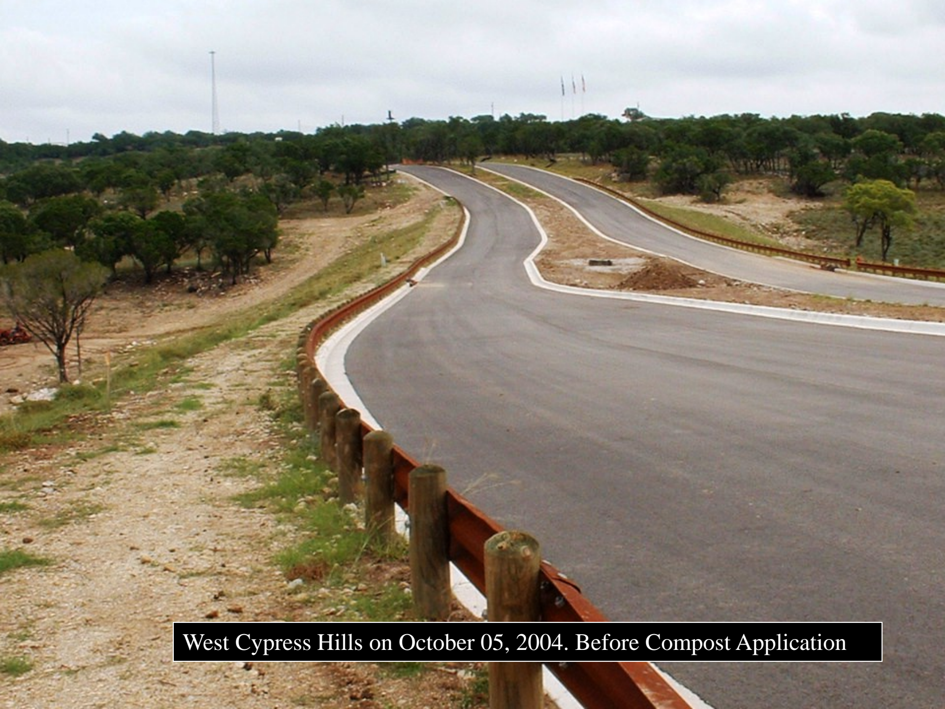
West Cypress Hills on October 05, 2004. Before Compost Application