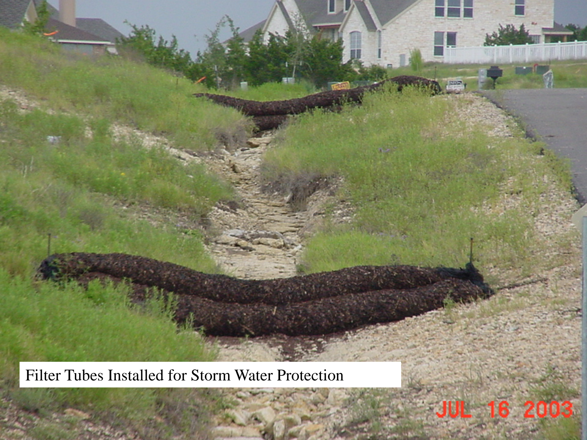
Filter Tubes Installed for Storm Water Protection