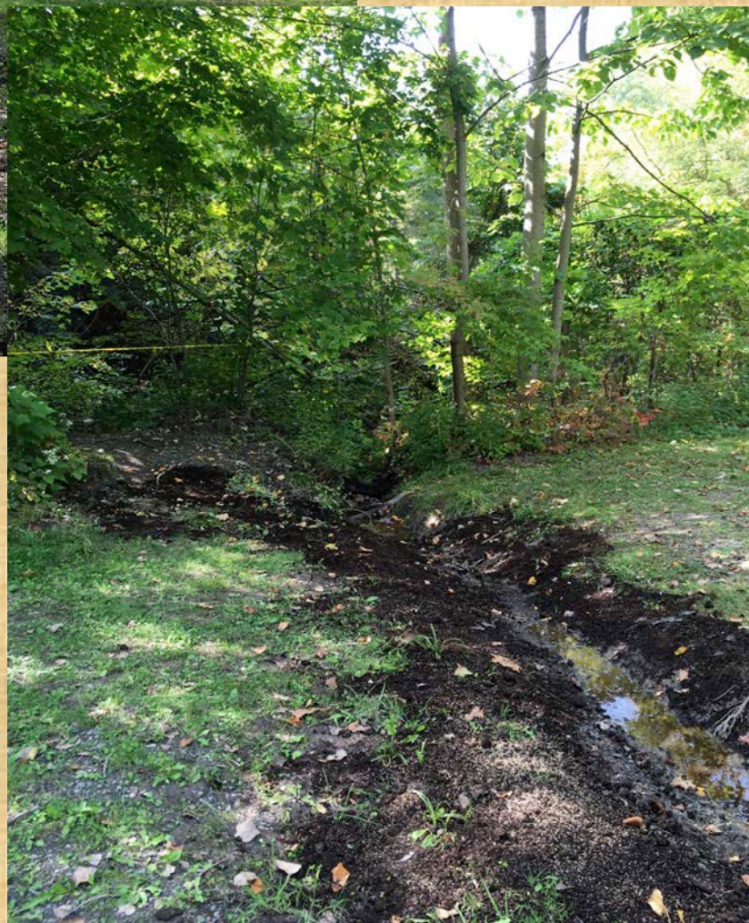
Swale at Upper Buttermilk